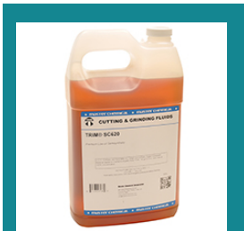
1-gallon jug SKU: SC620/1 UPC-12: 641238071389