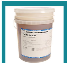
5-gallon pail SKU: SC620/5 UPC-12: 641238071372