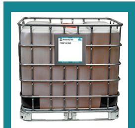
270-gallon tote SKU: SC620/NR270P UPC-12: 641238071402