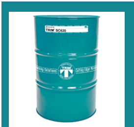
54-gallon drum SKU: SC620/54 UPC-12: 641238071365